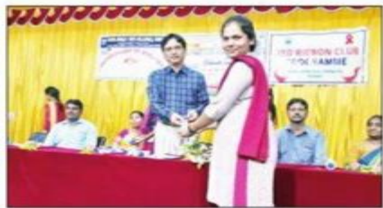
విద్యార్థులకు బహుమతులు అందజేస్తున్న ప్రిన్సిపాల్