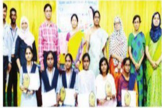
విద్యార్థులతో సిల్వర్జూబ్లీ కళాశాల బృందం