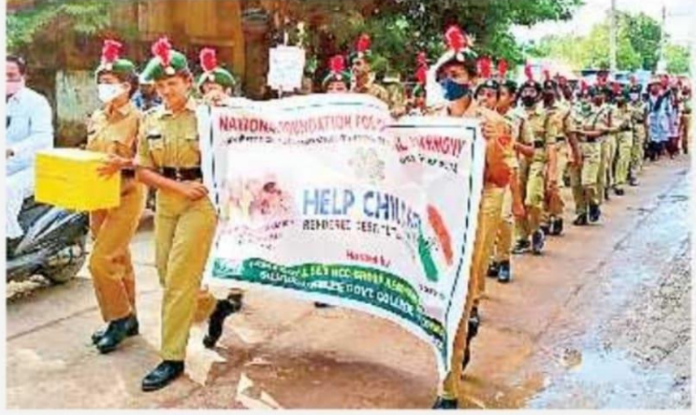
ర్యాలీగా సాగుతున్న విద్యార్థులు